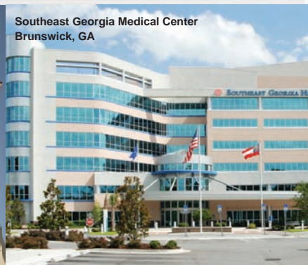
Southeast Georgia Medical Center Brunswick, GA