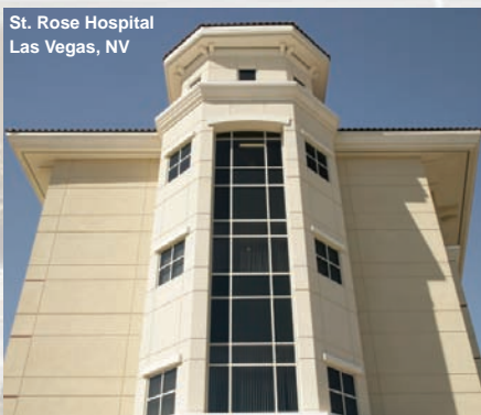
St. Rose Hospital Las Vegas, NV