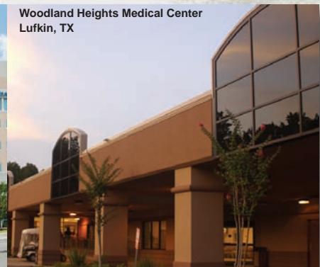
Woodland Heights Medical Center Lufkin, TX

www.dryvit.com www.dryvitisgreen.com www.dryvitcare.com