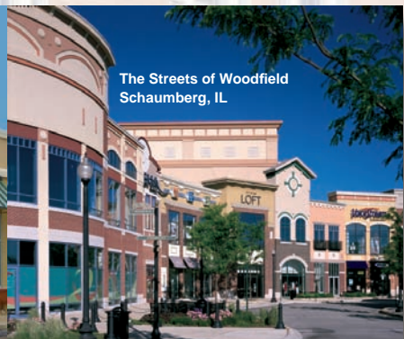
The Streets of Woodfield Schaumburg, IL

www.dryvit.com www.dryvitisgreen.com www.dryvitcare.com