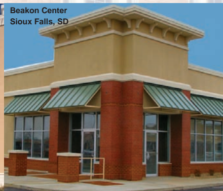
Beakon Center Sioux Falls, SD