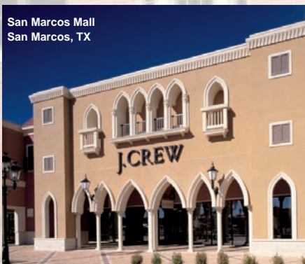
San Marcos Mall San Marcos, TX